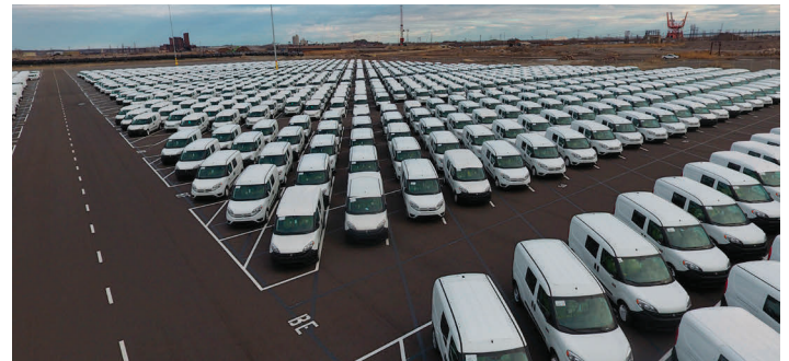
Image of our current RORO facility

Our automobile logistics capabilities are taking off more quickly than we could have imagined. To keep up with the booming market demands, we've been revamping marine infrastructure to accommodate ocean-going vessels that carry cars and expanded our storage yard from 20 to 130 acres. Our future plans for car logistics at Tradeport Atlantic include new and used vehicles that will move in and out of the facility by ship, train, and truck. With the Port of Baltimore acting as a world-renowned premier car port, we're expecting to stay busy, and as a continually changing process, our development around automobile logistics will unfold in various stages for years to come.