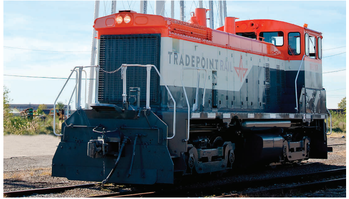
One of Tradeport Rail's branded locomotives

Governor Larry Hogan, who awarded Tradeport Atlantic with the Economic Impact Award from the Chesapeake Gateway Chamber of Commerce, touted the study as further proof of the development's impact for the city and state at large. "As the results of this study clearly demonstrate, it will significantly contribute to the growth of private sector jobs and provide hardworking Marylanders with the opportunities they need and deserve," he said.